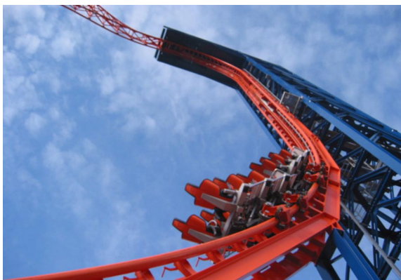
Humpty Bump Lift

The Humpty Bump is followed instantly by a 360° heart roll and a plummeting vertical drop at 105 km/h (65mph). After swinging spectacularly to and fro, again at impressive heights, the X-Car returns to the station – or, depending on requirements and capacity, launches itself over the summit once more and embarks on another breathtaking ride.