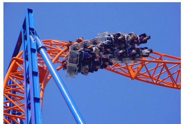
Before the Drop